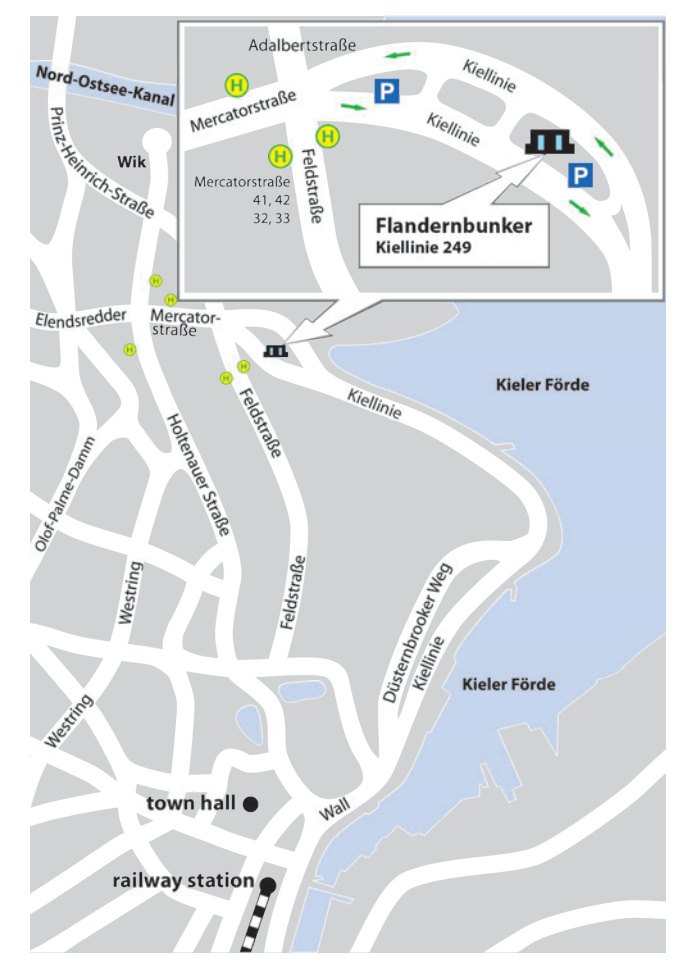
Mahnmal Kilian e.V.